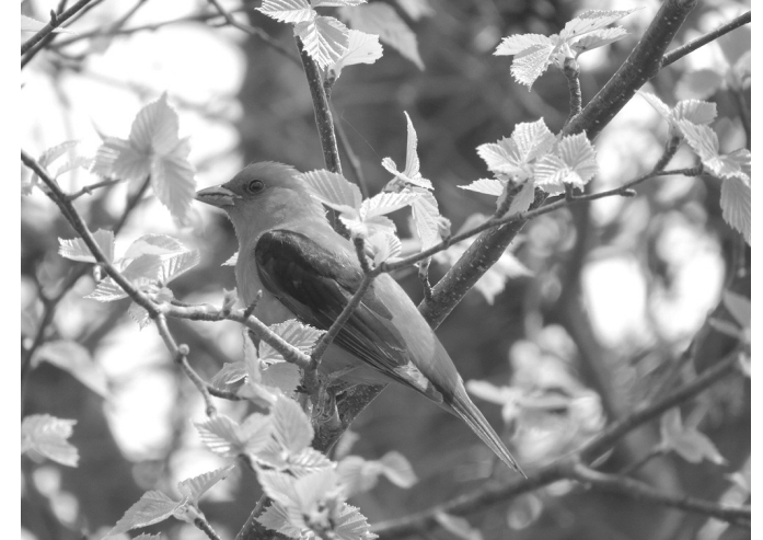
The Petoskey Regional Audubon Society (PRAS) invites the public each Tuesday and Thursday in May for free early morning bird walks to share the wonders of spring migration throughout the month (Scarlet Tanager shown here).

The Tuesday morning walks begin at 9 am at Pond Hill Farm near Harbor Springs. Pond Hill Farm is located approx. five miles northwest of Harbor Springs on M-119. It is easy walking on flat farm lanes. The Thursday morning walks will begin at 7:30 am at Spring Lake Park. Spring Lake Park is located near