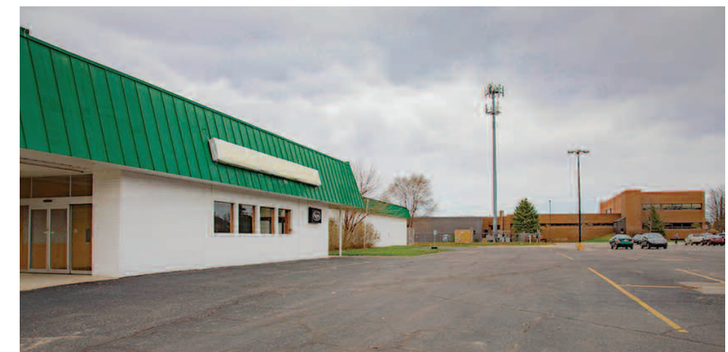
Great Lakes Energy Cooperative (GLE), announced today the purchase of 1315 Boyne Avenue in Boyne City, formerly a Carter's Food Center.

GLE has been slowly outgrowing their current building and began to identify and pursue possible locations within the Boyne City community last year. Truestream, GLE's new